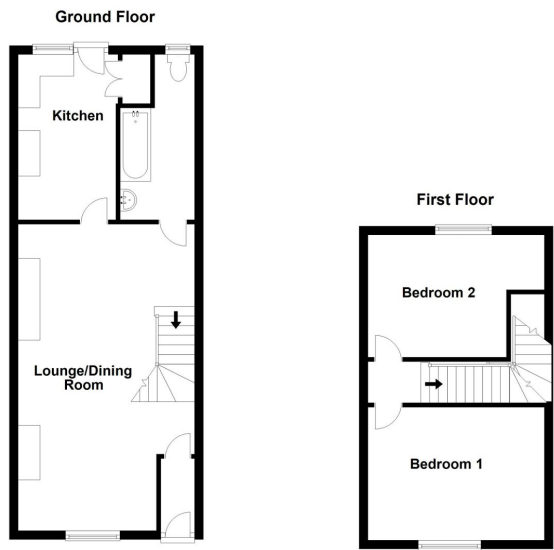
This plan is to be used only as an indication of the floor layout and is not to scale. Plan produced using PlanUp.